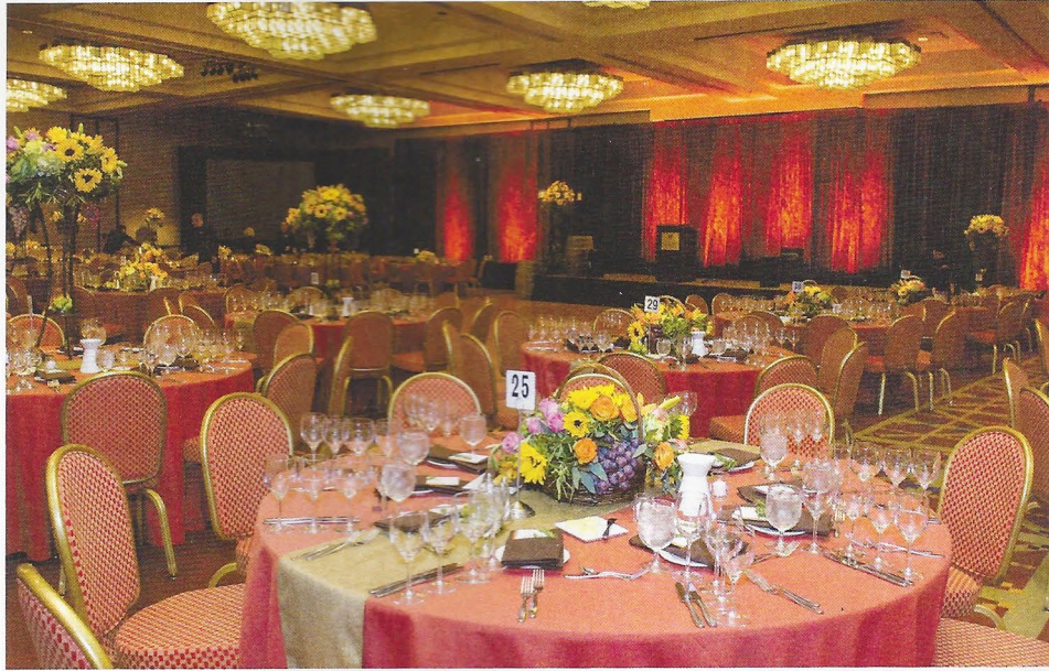
SCENES FROM LAST YEAR'S EVENT

For information or tickets, call 624-2333, ext. 100